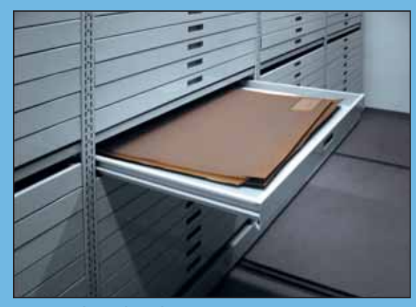
- graphical cabinets