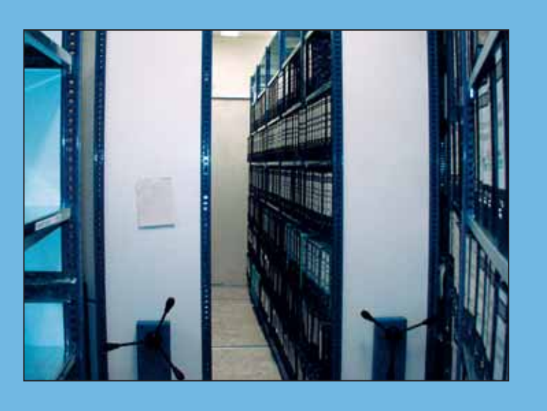
The supplies are executed in accordance with the norms ČSN EN ISO 9001:2001 and EN ISO 14001:2004. The racks are approved in the operation by SZÚ and are equipped with SZÚ certificate.

The racks, both fixed and mobile, can be adjusted, completed so that they can be commonly used in the offices together with the standardly supplied furniture.