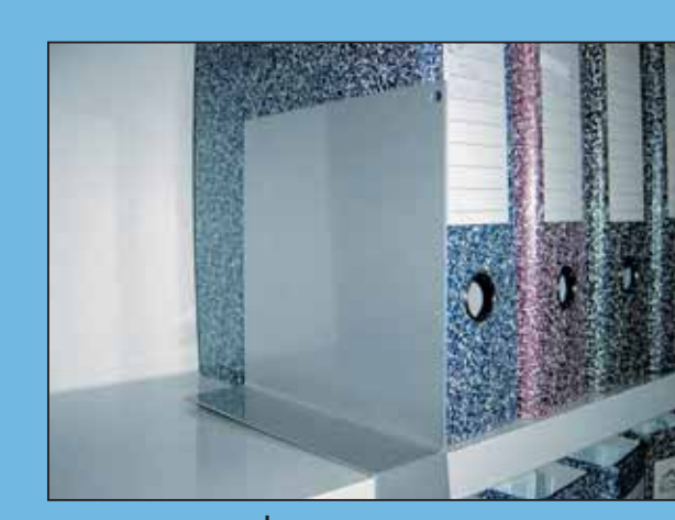
- separating barriers