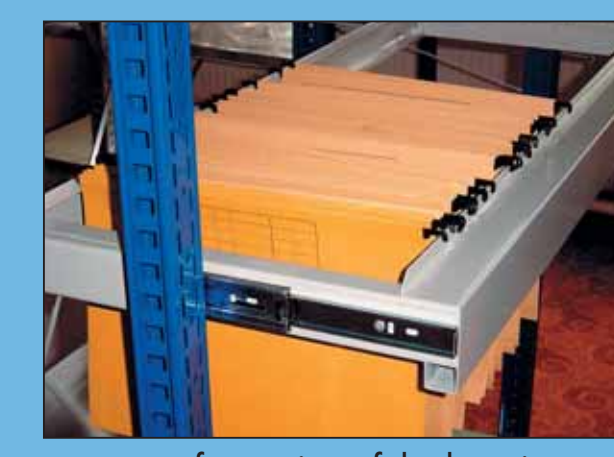
- systems for storing of the hanging document files - sliding